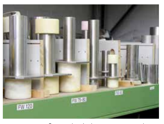
Screw tubes in the spare parts warehouse