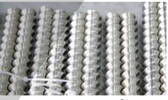
Twin concave screws