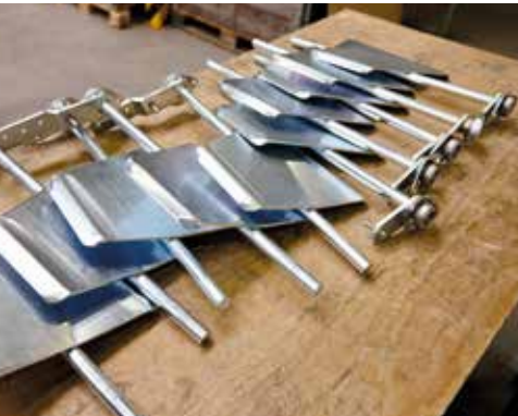
Always the right spare part