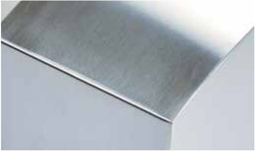
Smooth stainless steel surfaces, rounded edges and polished weld seams