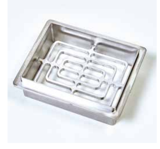
A special design with internal wiring protects against contamination.

A safety grate provides the necessary operator protection when bulk ingredients are being manually added to the process.