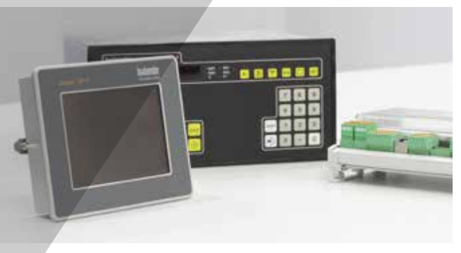
Retrofitting controls or control upgrade