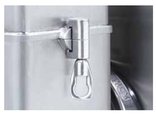
Quick-release fasteners for simple, clean dismantling/ removal