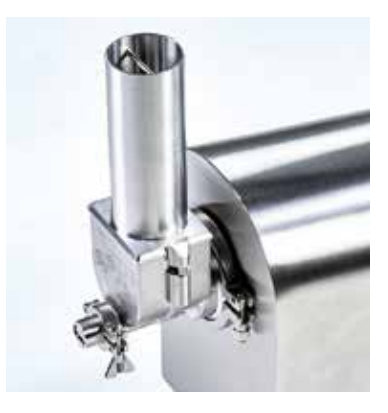
Various add-on hoppers are available for the MiniTwin feeder.

All individual parts can easily be dismantled.