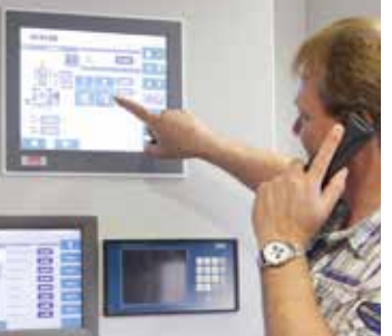
Remote maintenance and troubleshooting