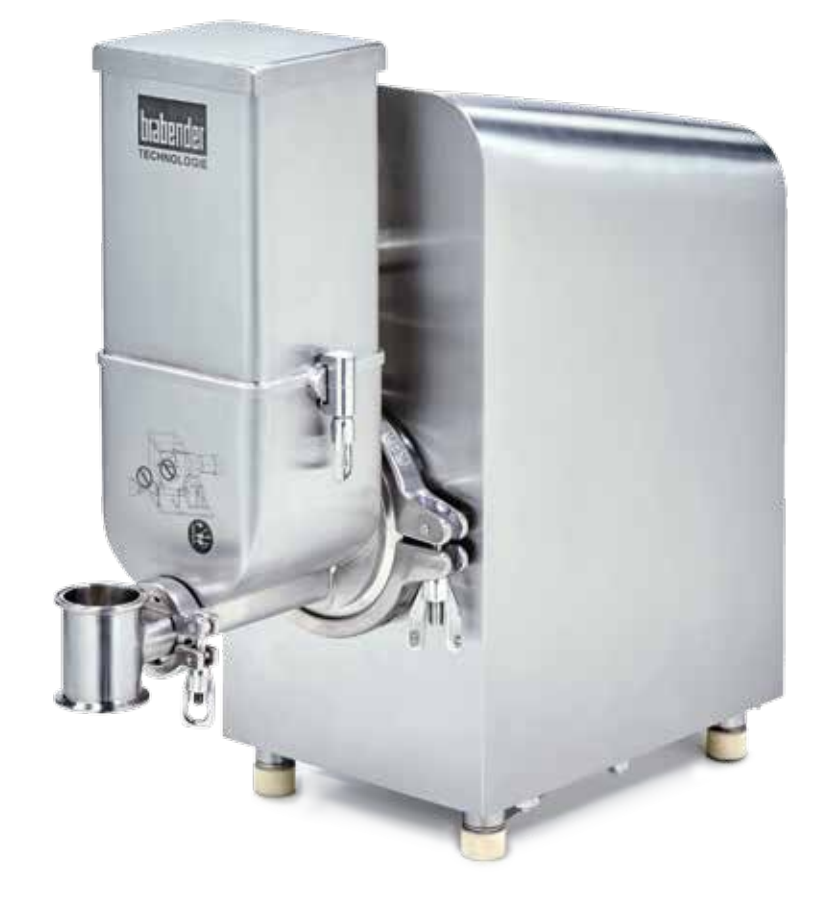
Pharmaceutical industry version of a twin screw feeder incorporating FDA-conform materials