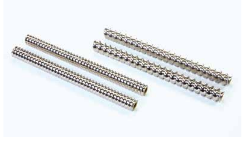
For maximum feed rate performance: specially designed screws ensure efficient handling of particularly light, poor flowing and fluidizing powders.