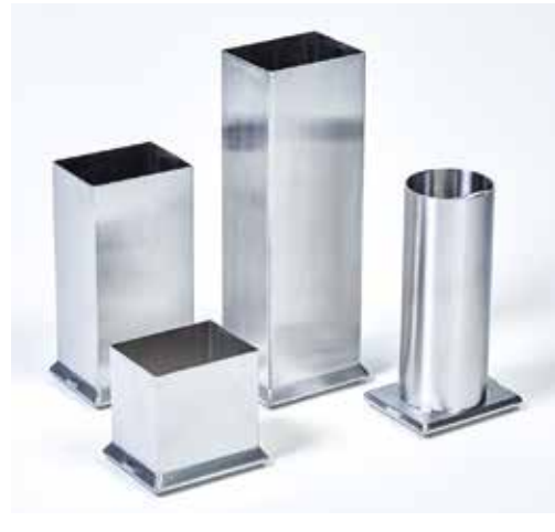
A range of different hoppers sized 0.5, 0.6, 1 and 1.5 dm^3 are available for our pharmaceutical industry feeders.

An additional downsizing kit enables the size of the feeder hopper to be reduced – particularly important if premium, expensive ingredients are involved.