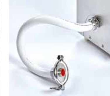
Sanitary wiring solution